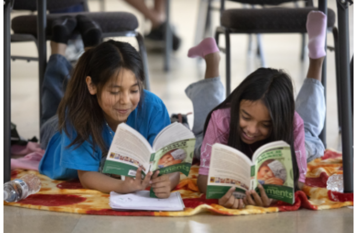
Reading and writing summer camp 2025.

Because of your support, these students are breaking barriers, pursuing dreams, and writing a new future with their families.