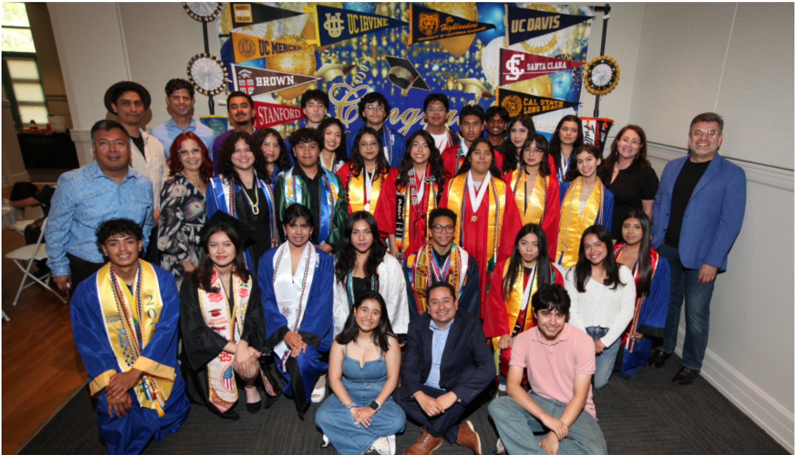
2025 graduation celebration.