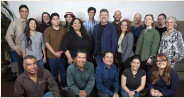
Uncommon Good staff.

You may notice a new look! Starting with this edition, our newsletter is becoming a bulletin featuring engaging updates issued 2-3 times a year. Each bulletin will highlight the impact you make possible as we share stories, data, and ways to get involved. At the end of the year, we will share an Annual Impact Report , celebrating a comprehensive summary of what we have accomplished together.